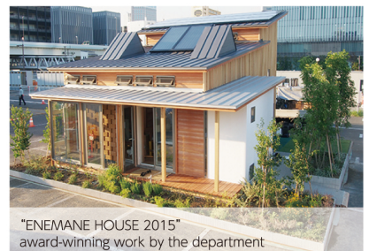
"ENEMANE HOUSE 2015" award-winning work by the department