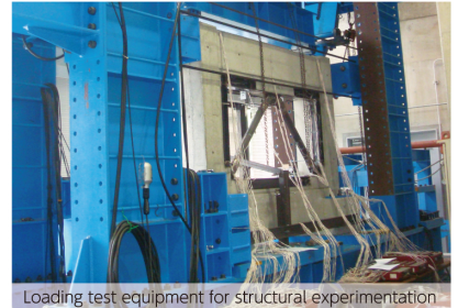
Loading test equipment for structural experimentation

Design systems - Basic design technologies for creating a beautiful space. Technologies that turn concepts into a reality. Technologies for utilizing people's sensibilities and psychology in design.